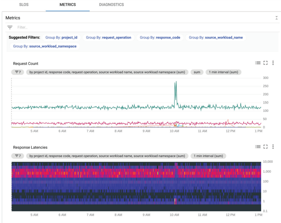
FIGURE 8.1 Service dashboard showing request count and latency time series data